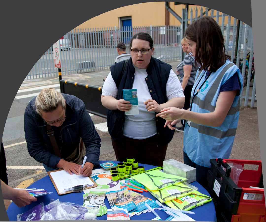
Advice, information and promotion at a Choose How You Move Workplace event.